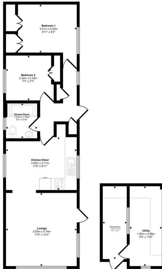
Floorplan Approx 48 sq m / 517 sq ft

Approx Gross Internal Area 60 sq m / 645 sq ft