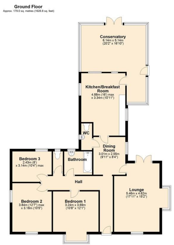
Total area: approx. 179.0 sq. metres (1926.8 sq. feet)