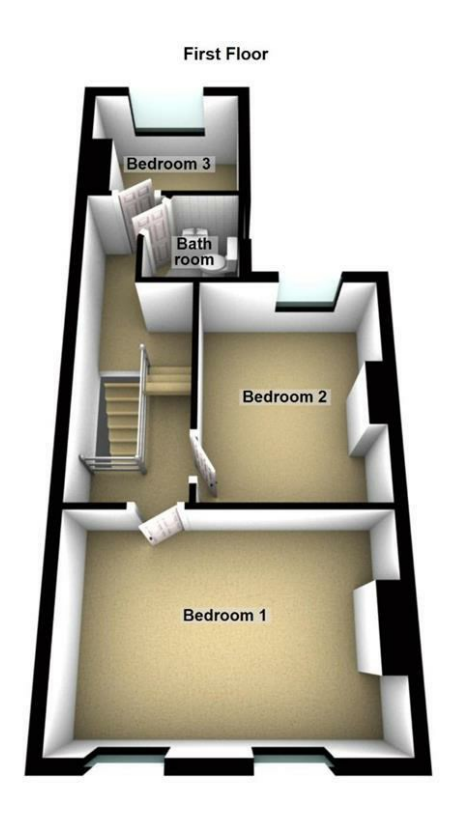
34 Redland Road, Malvern

These particulars, whilst believed to be accurate are set out as a general outline only for guidance and do not constitute any part of an offer or contract. Intending purchasers should not rely on them as statements of representation of fact, but must satisfy themselves by inspection or otherwise as to their accuracy. No person in this firms employment has the authority to make or give any representation or warranty in respect of the property.