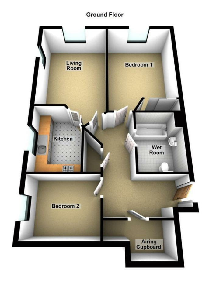
38 Cartwright Court, Victoria Road, Malvern