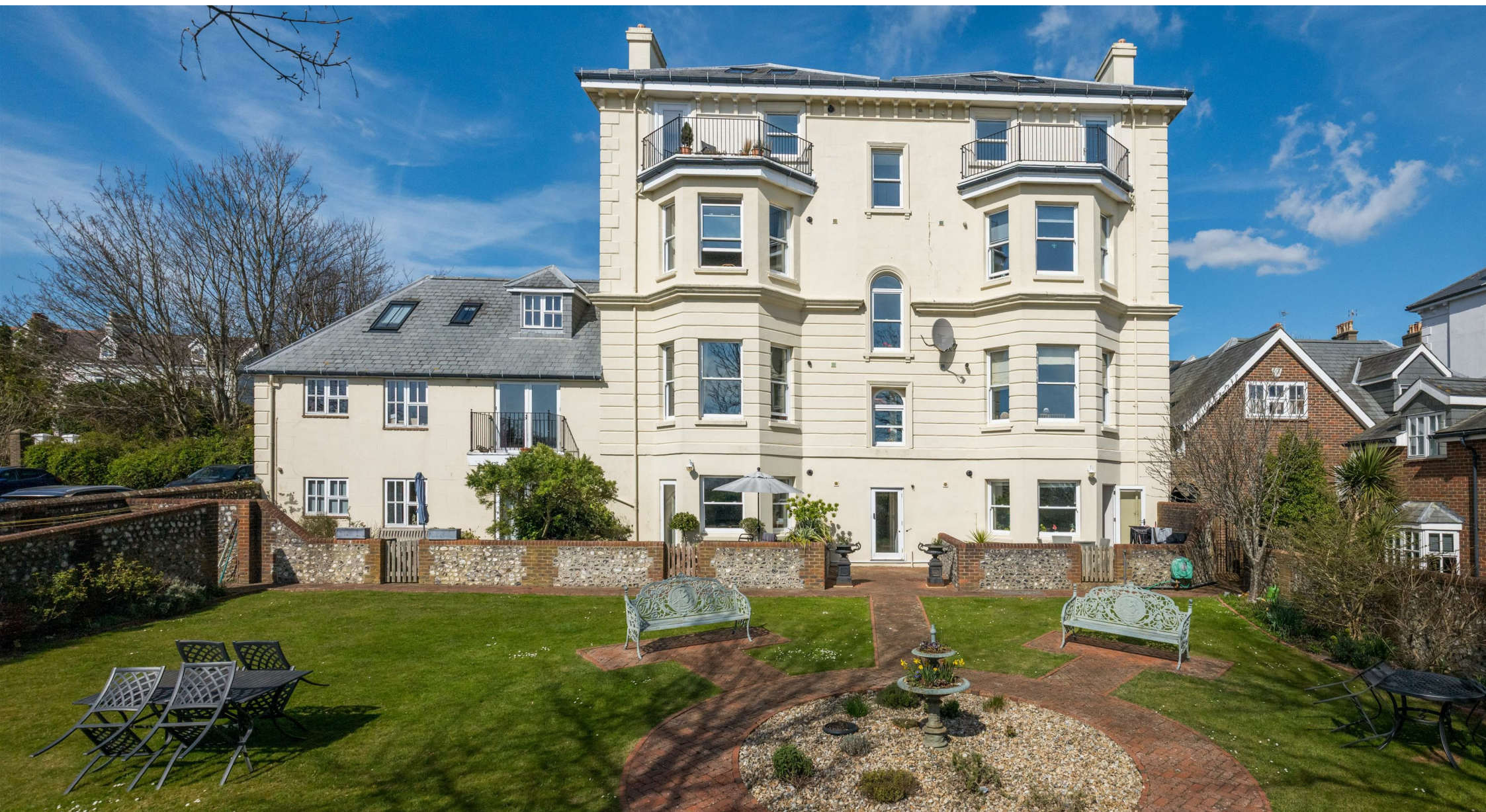
Southdown House, 44 St Annes Crescent