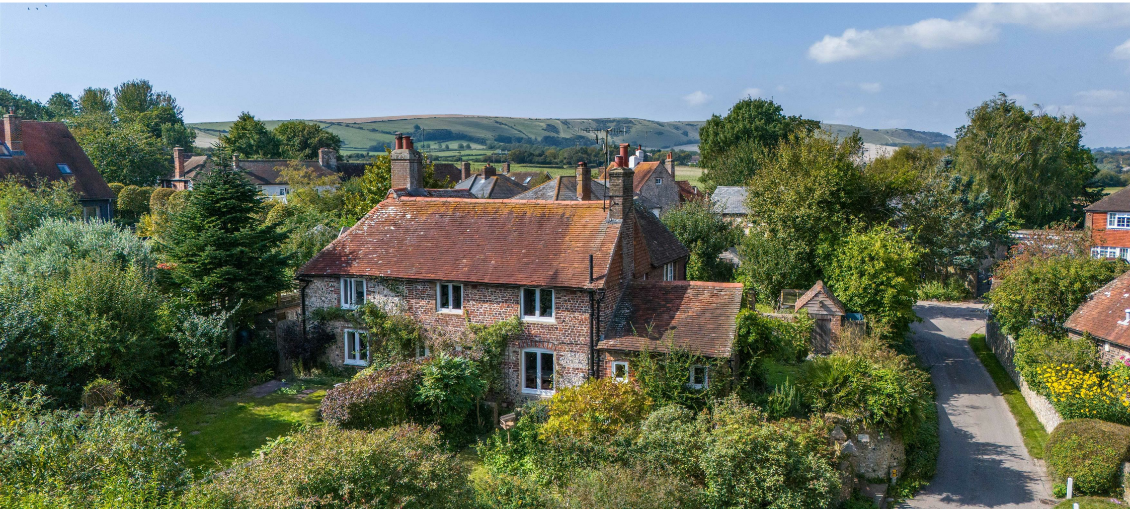
The Street, Lewes