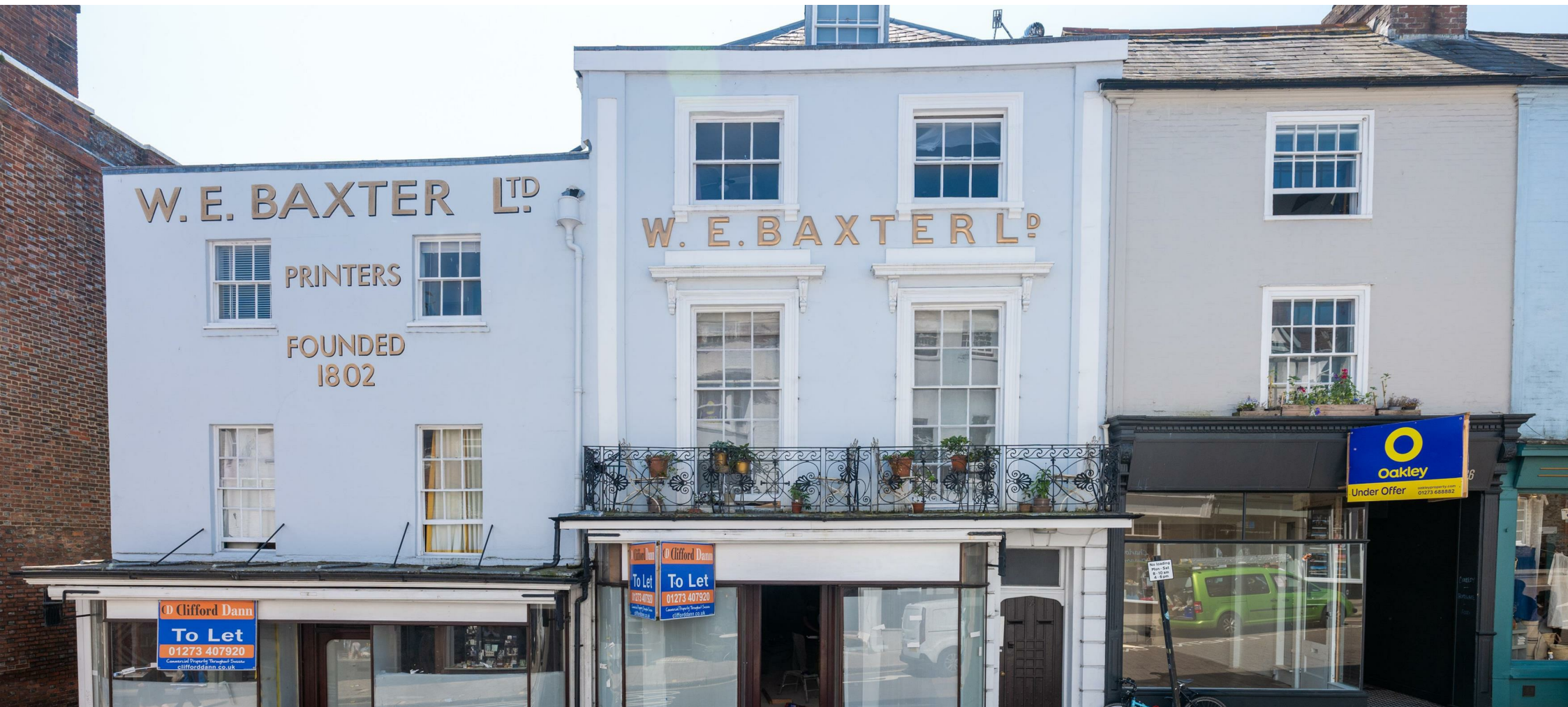
High Street, Lewes