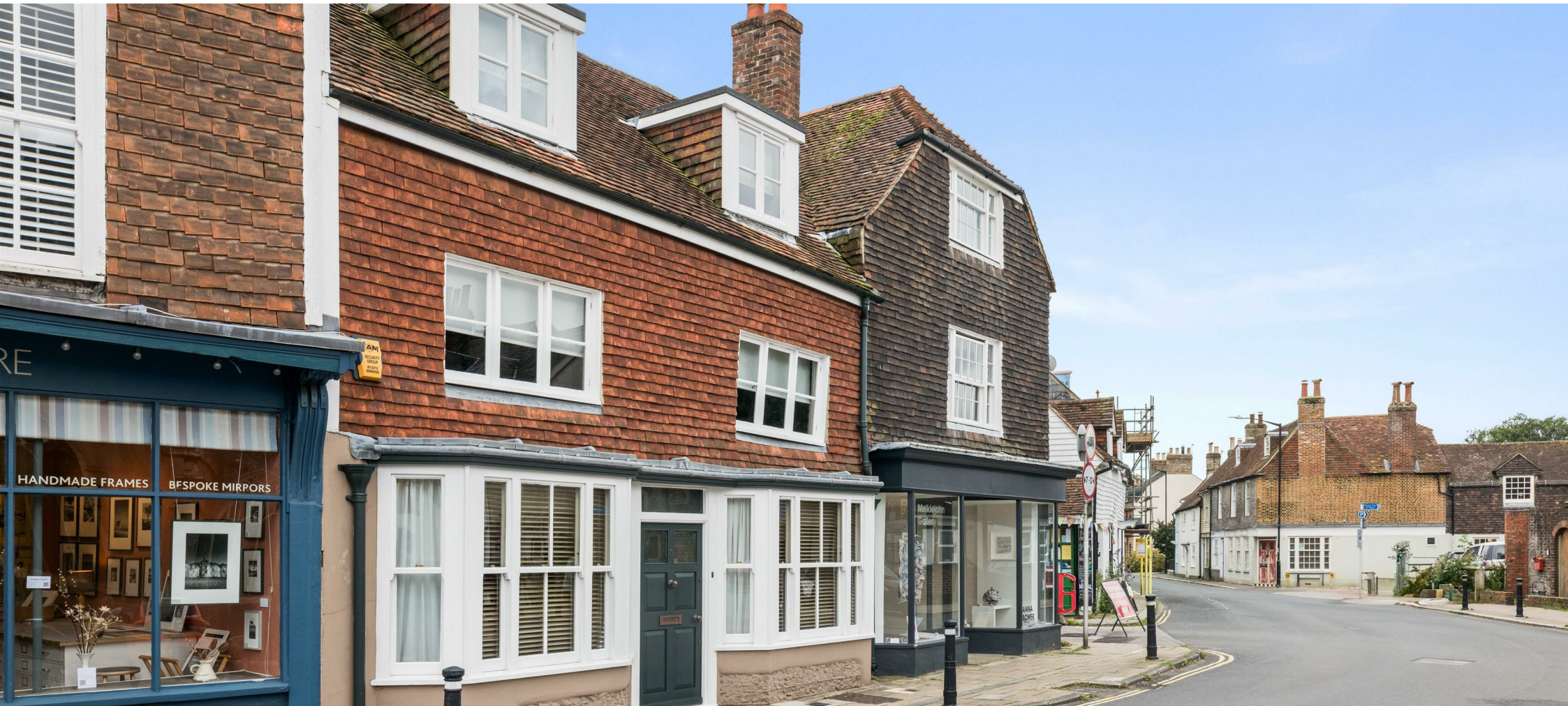
Malling Street, Lewes