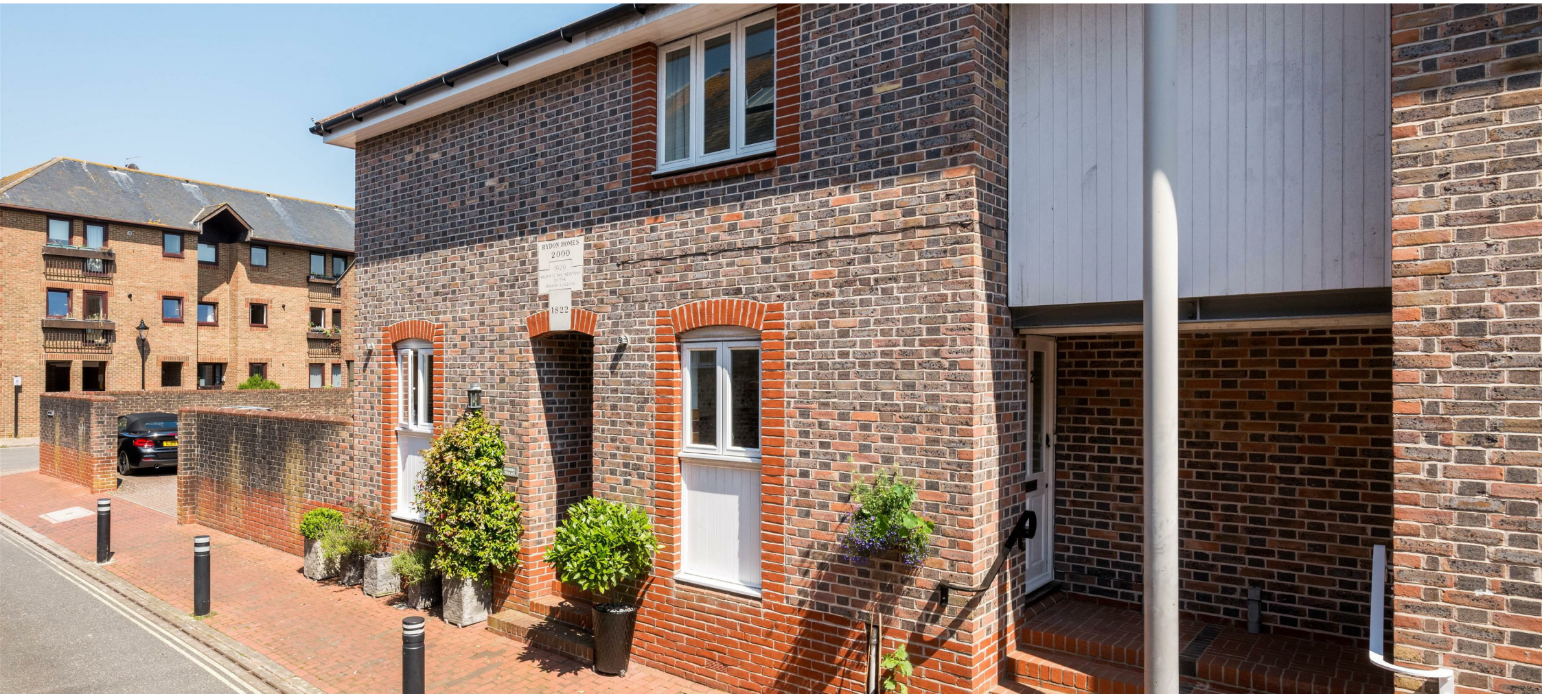
Foundry Terrace, LEWES