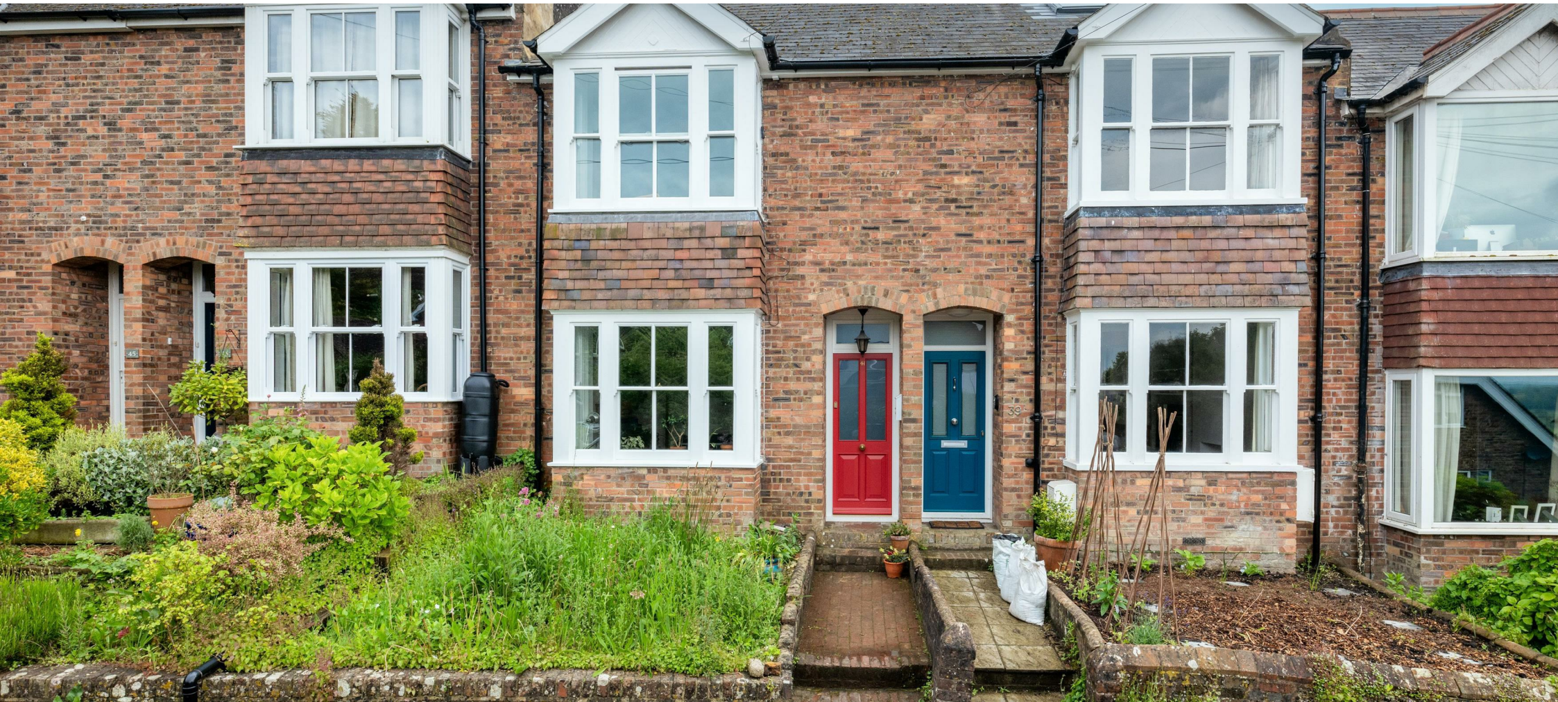
Mill Road, Lewes