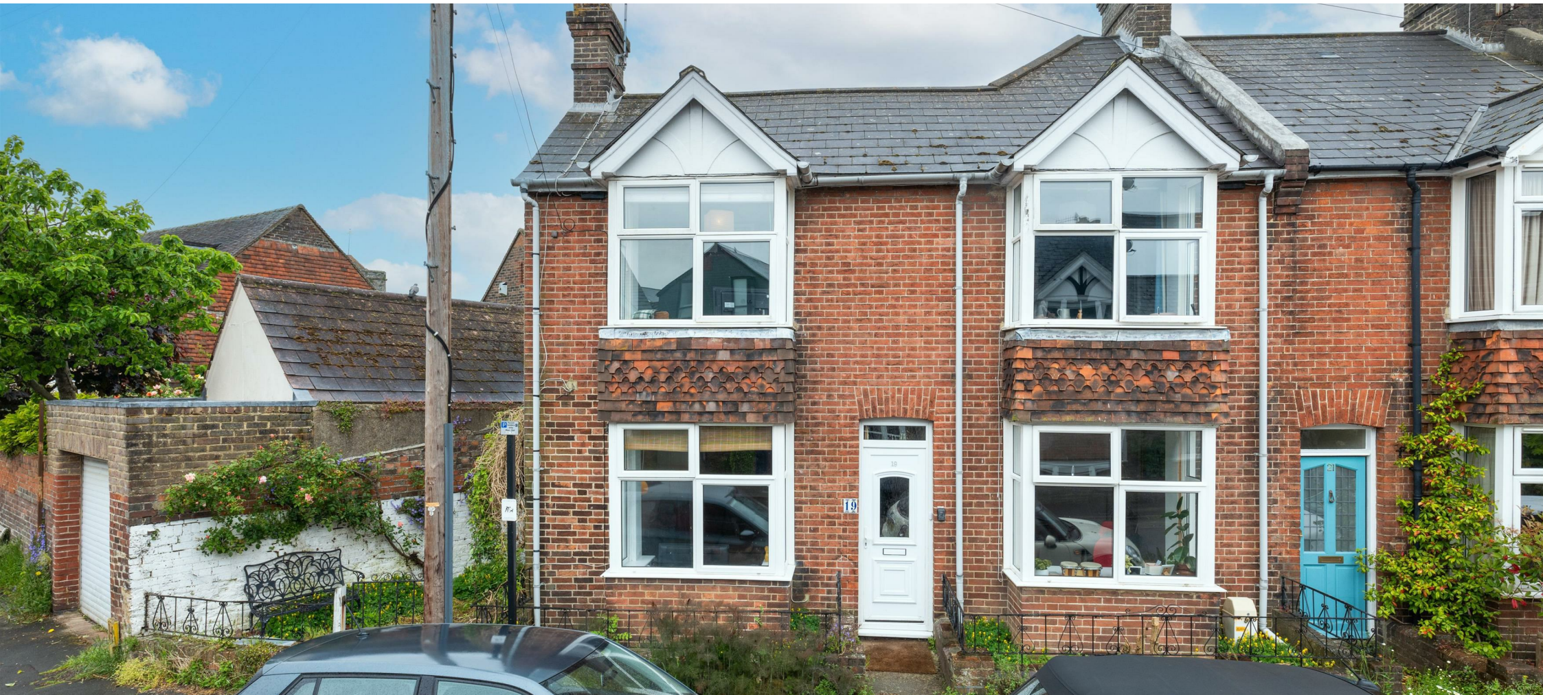
Morris Road, Lewes