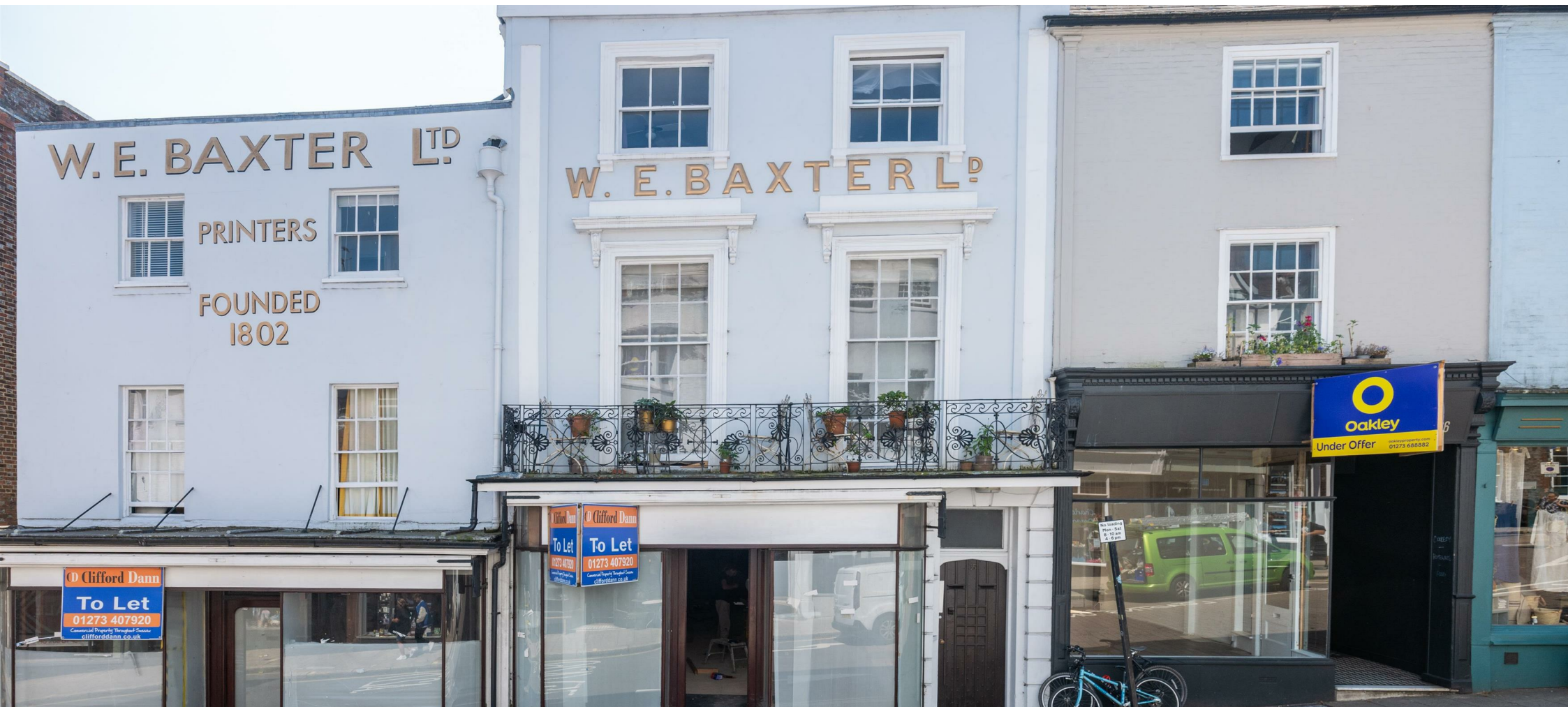
High Street, Lewes