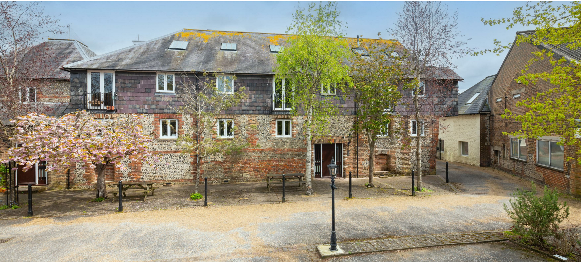
Foundry Lane, Lewes