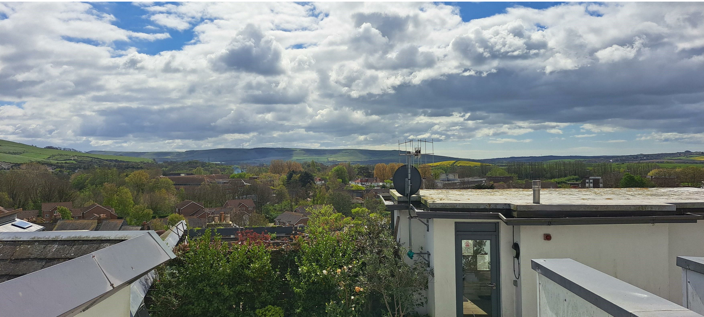
St. Nicholas Lane, Lewes