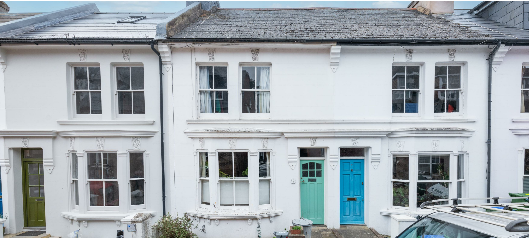
Talbot Terrace, Lewes