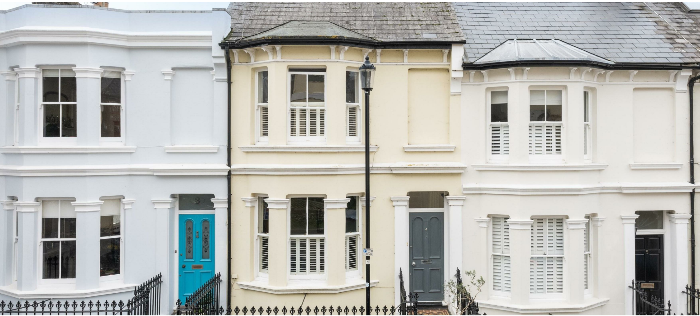
St. Johns Terrace, Lewes