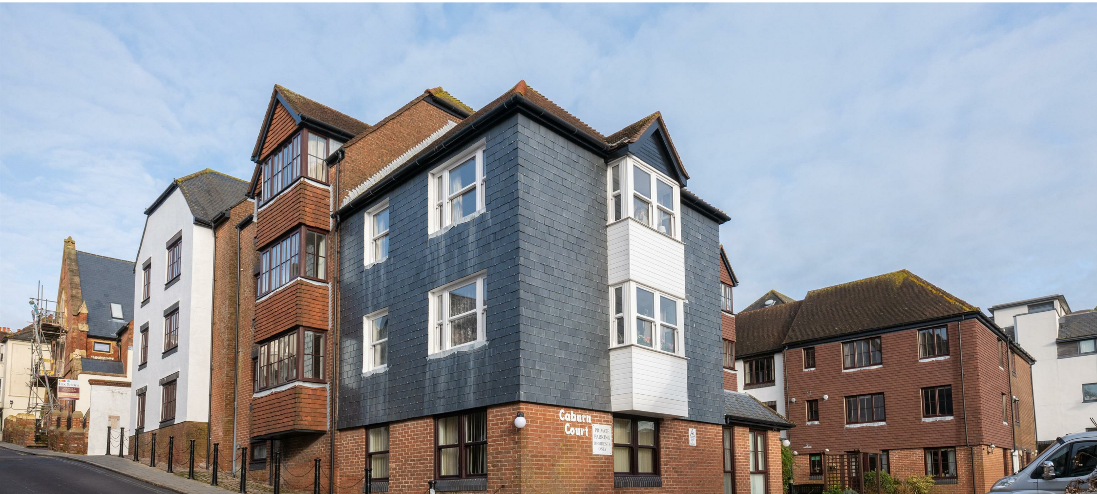
Station Street, Lewes