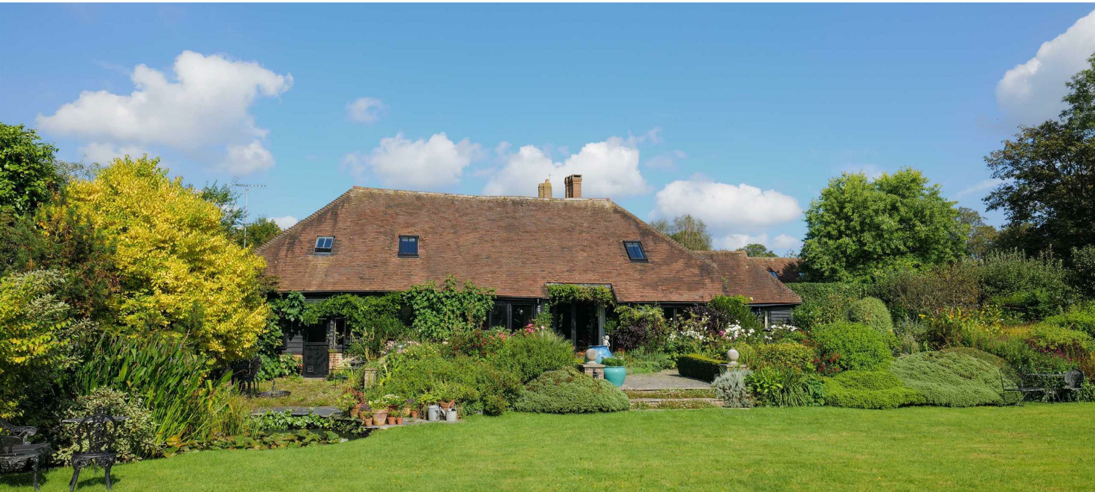
Lywood Common, Lindfield