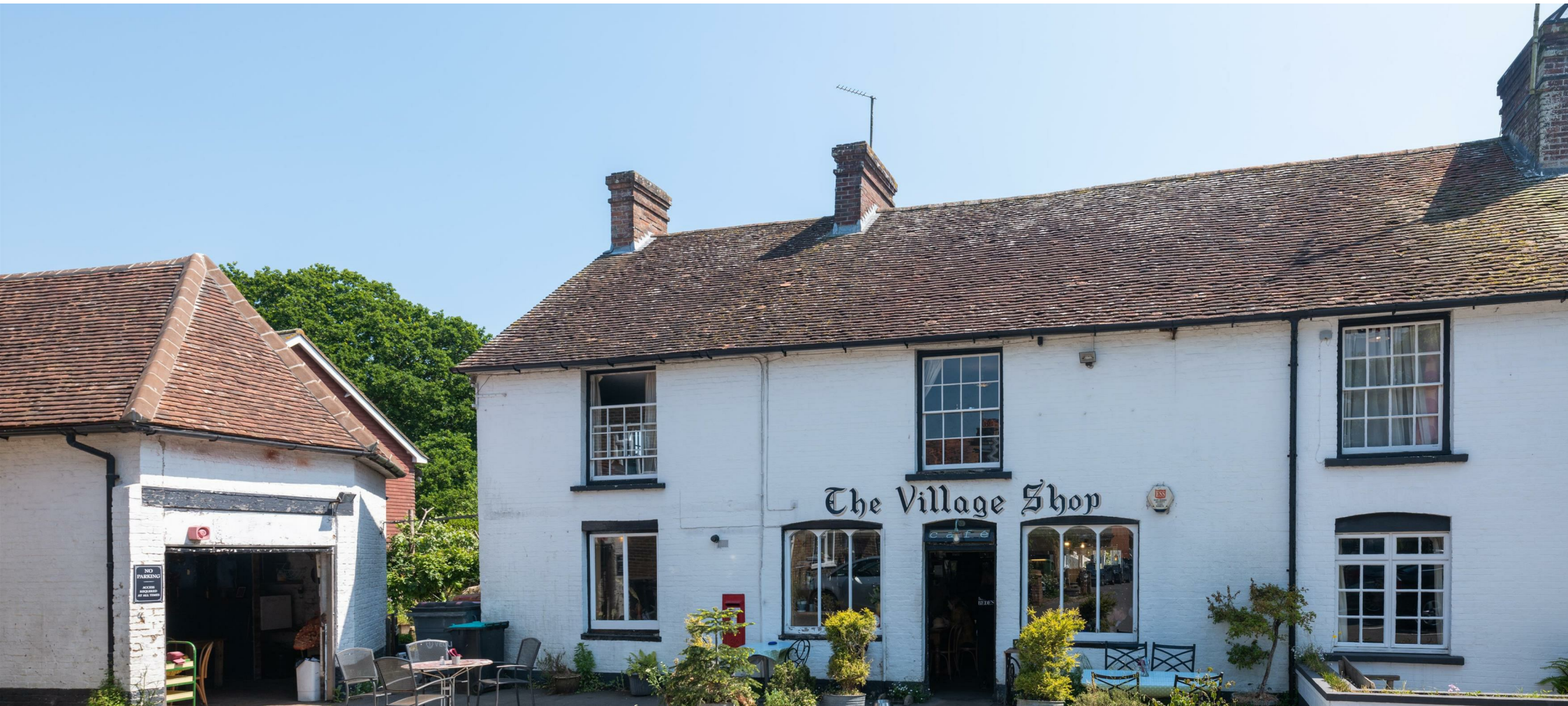
Coldharbour Road, Hailsham