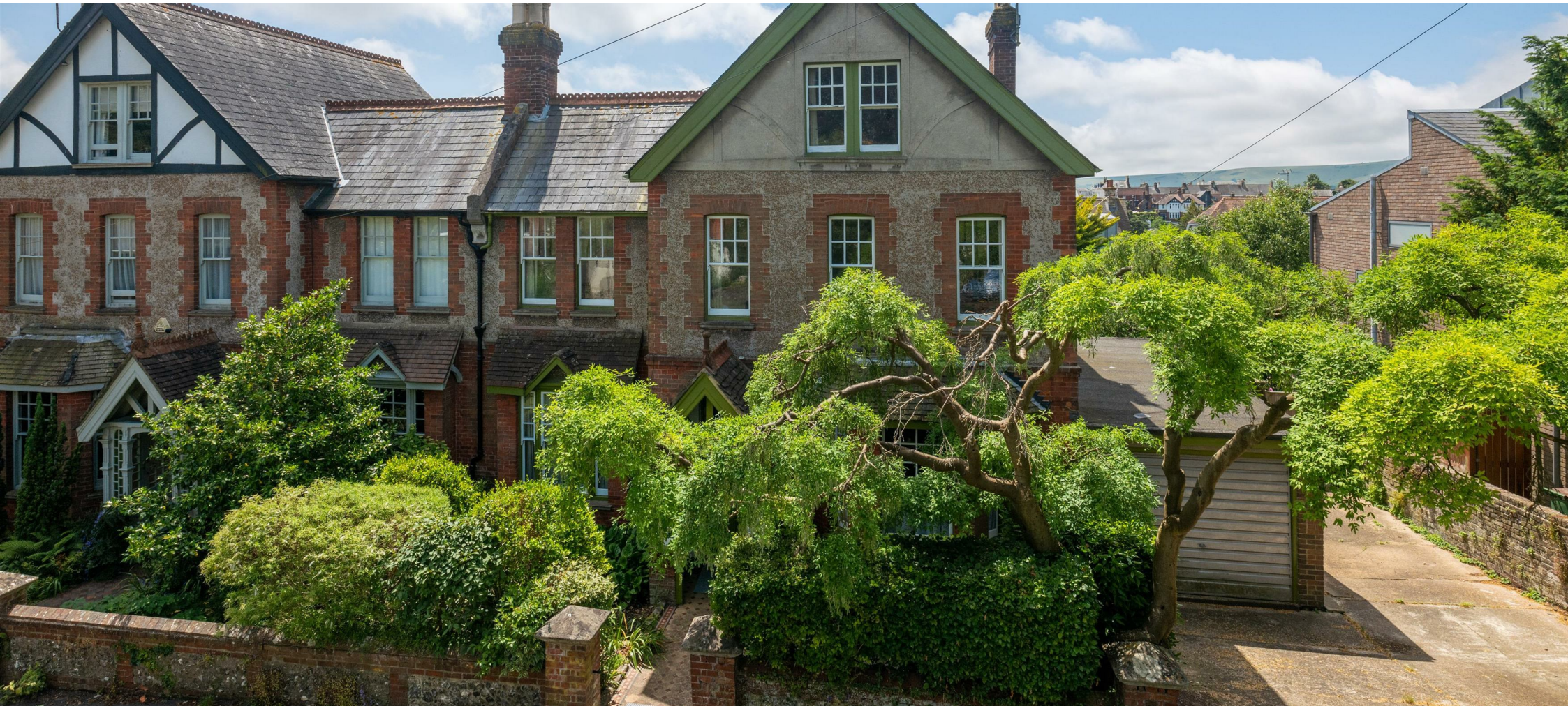
Prince Edwards Road, Lewes