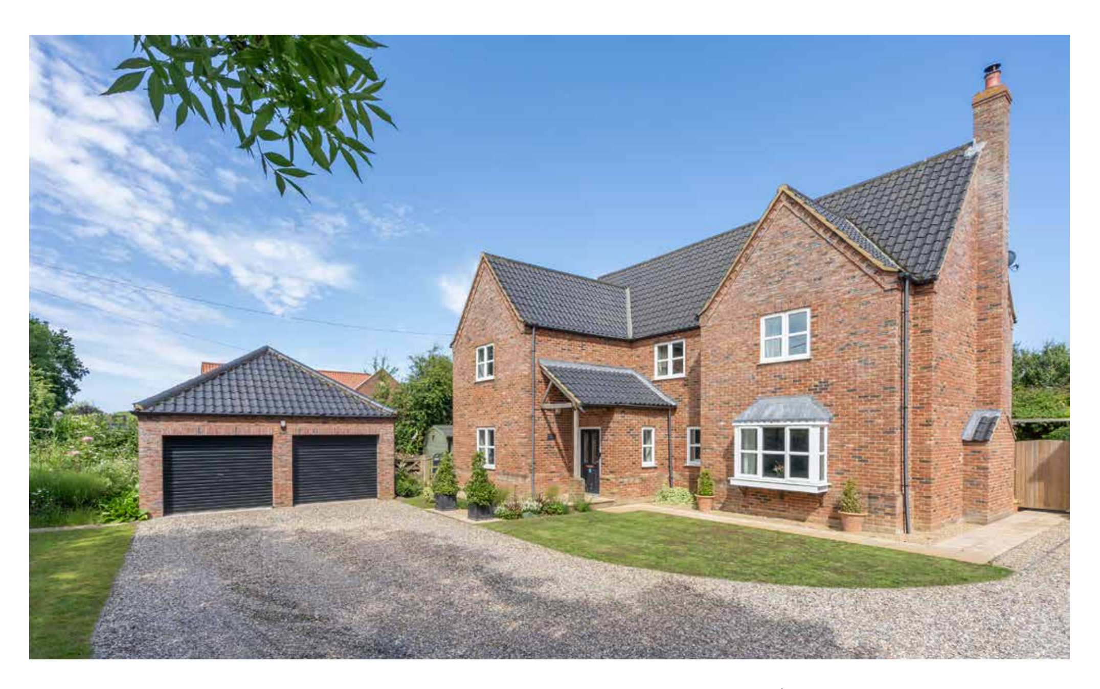
Charles House School Lane | Neatishead | Norfolk | NR12 8EW