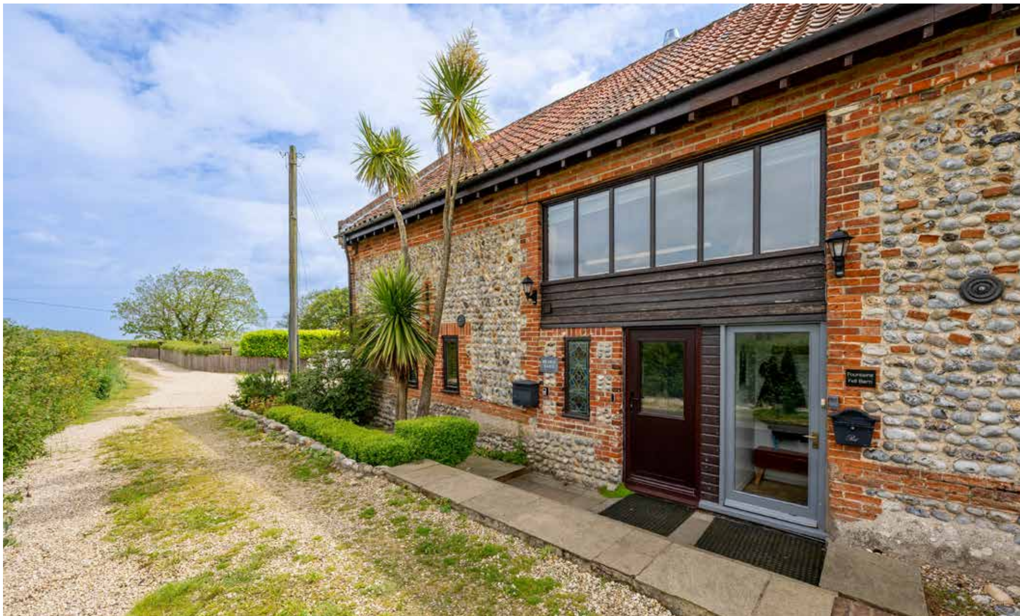
Bridge Barn Main Road | Sidestrand | Norfolk | NR27 0LS