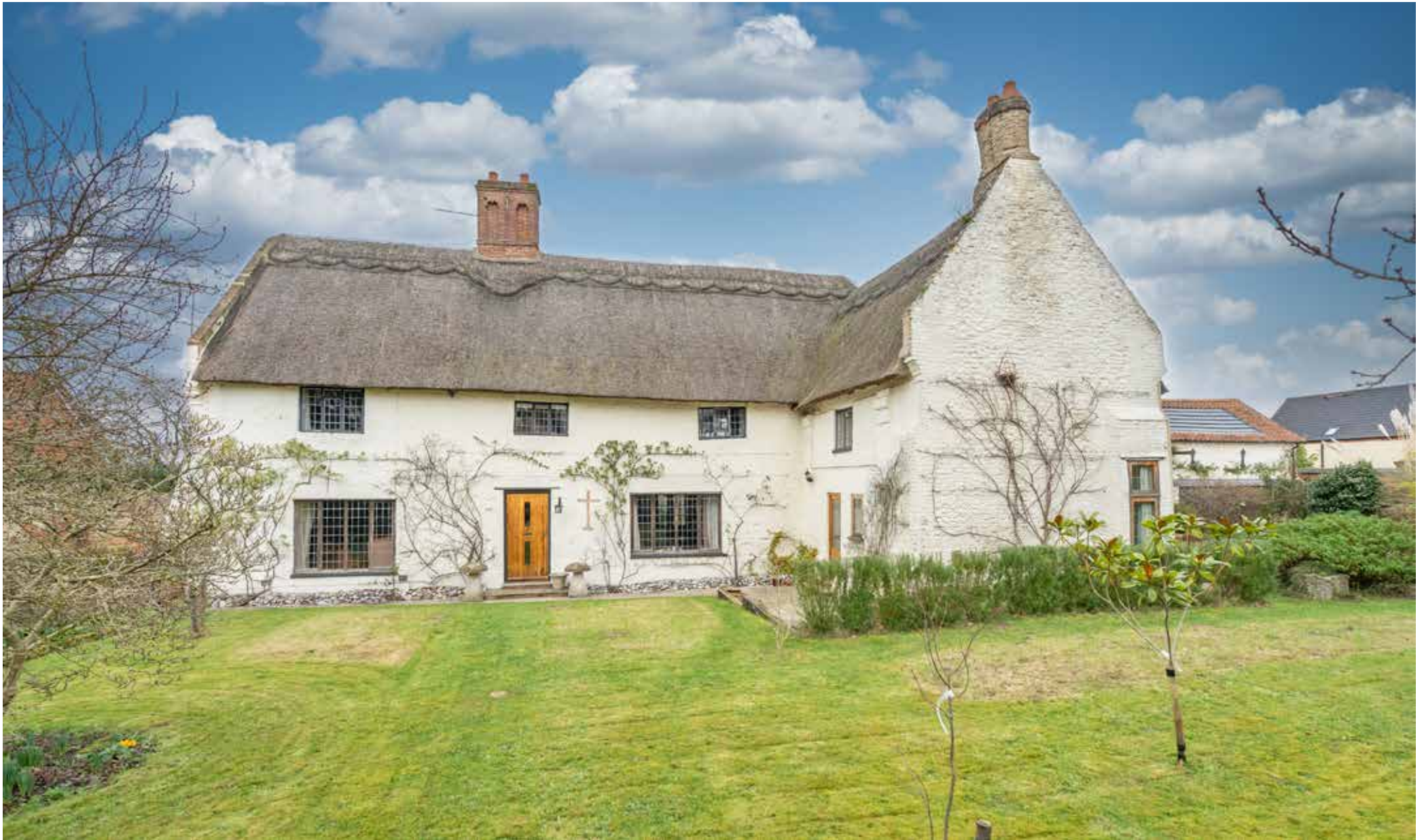
Oaklands Farmhouse 29 Norwich Road | Strumpshaw | Norfolk | NR13 4AG