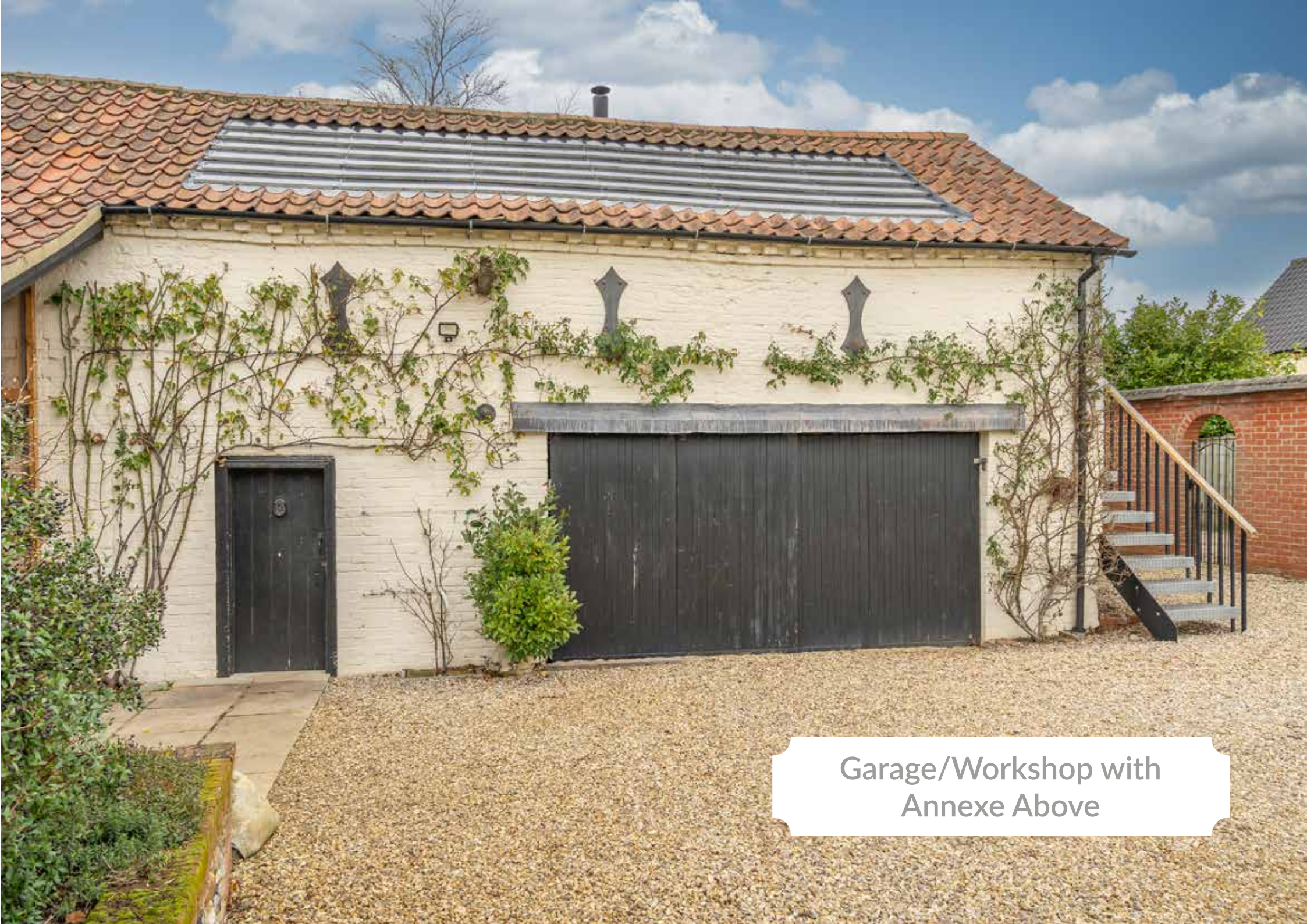
Garage/Workshop with Annexe Above