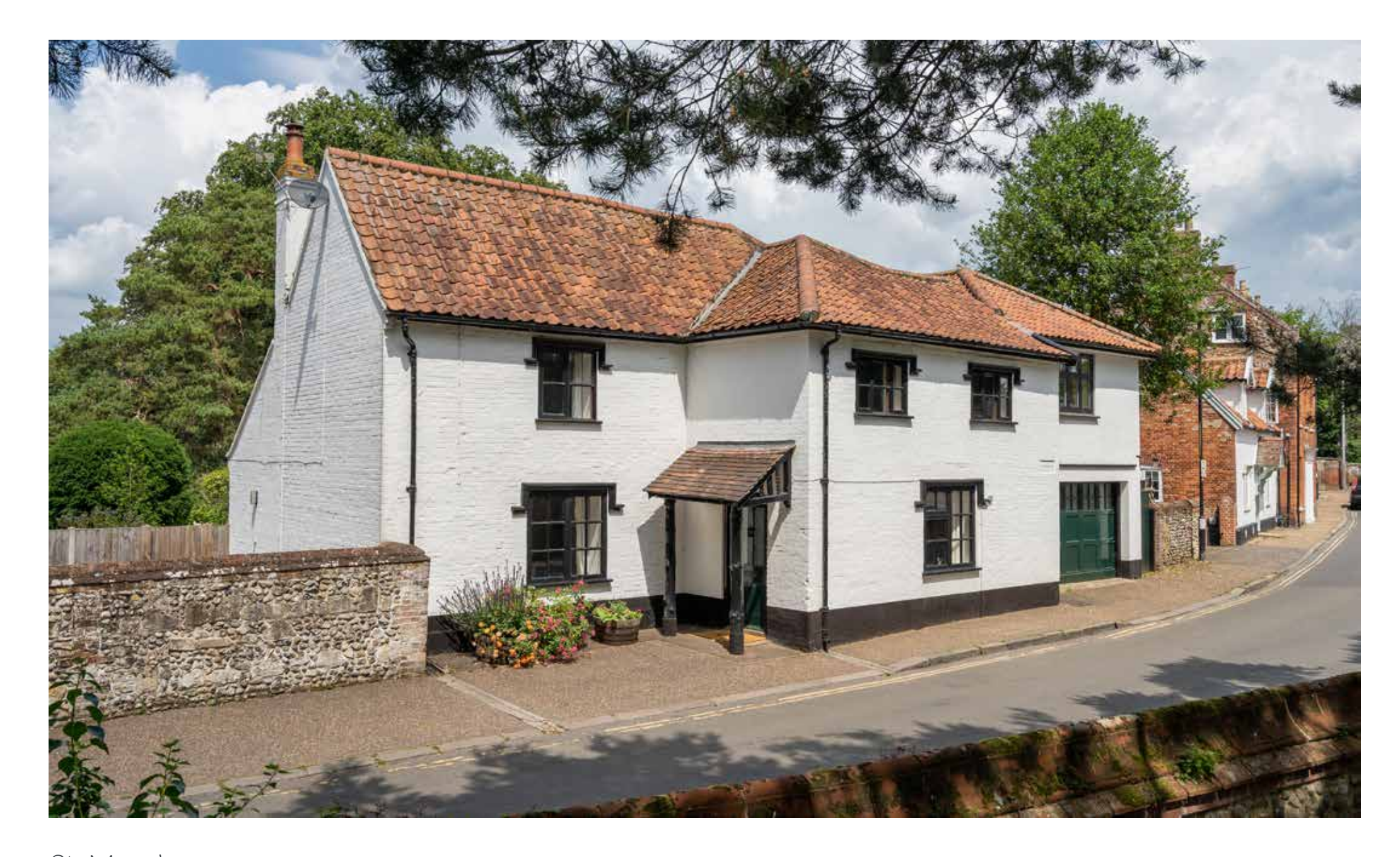
St. Mary's Becketswell Road | Wymondham | Norfolk | NR18 OPJ