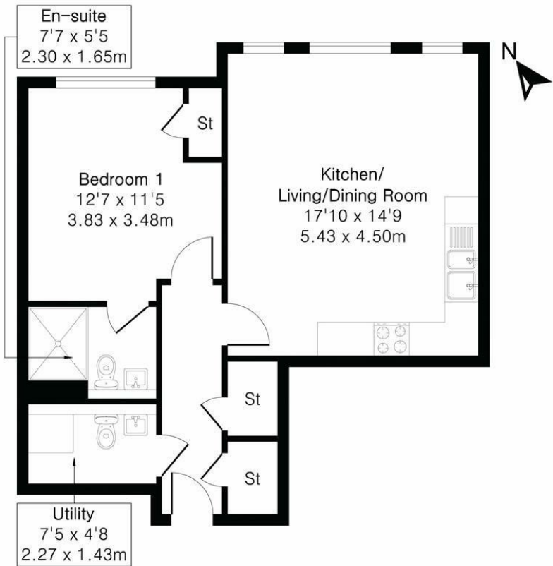
Ground Floor Flat

Approximate Gross Internal Area 572 sq ft - 53 sq m