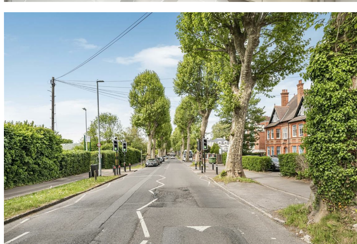
Council tax band B Council-Reading