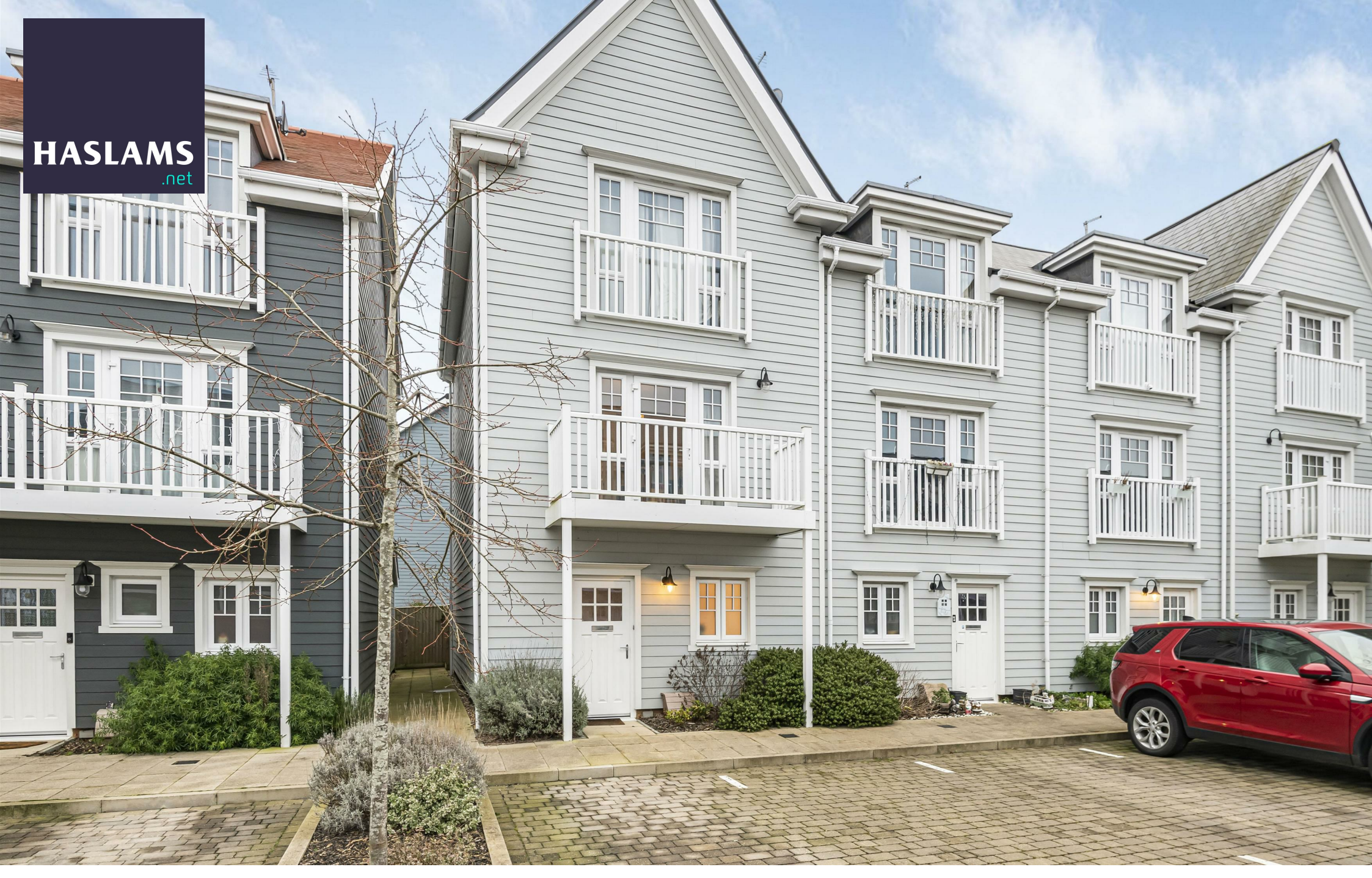
52, Maine Street, Reading, RG2 6AG