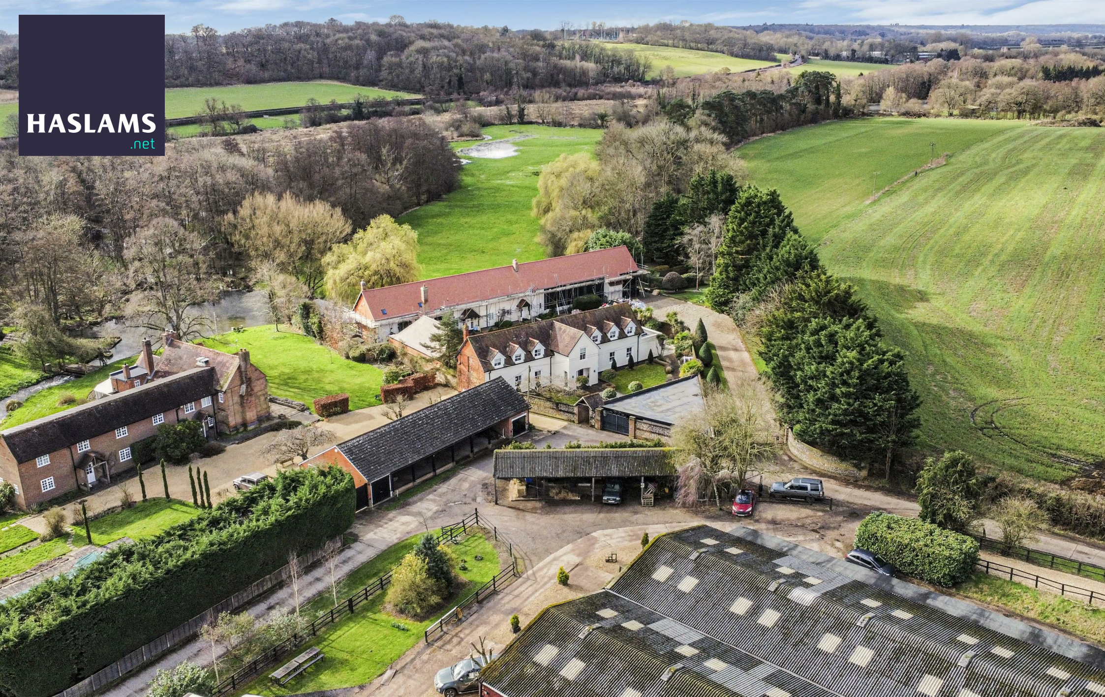
The Courtyard, Maidenhatch, Pangbourne, Reading