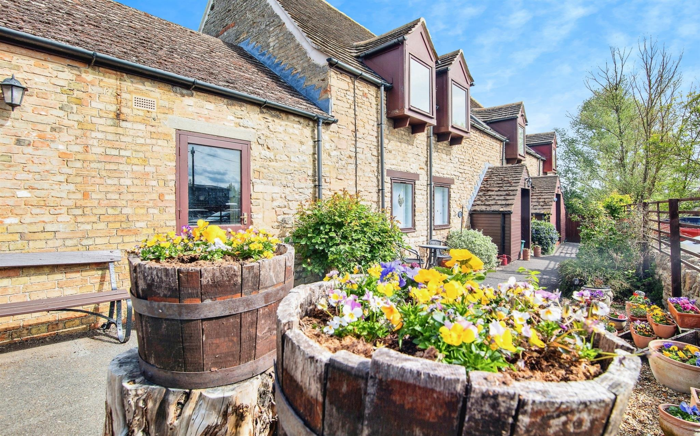
Trent House, Riverside Maltings, Oundle £152,000 Leasehold