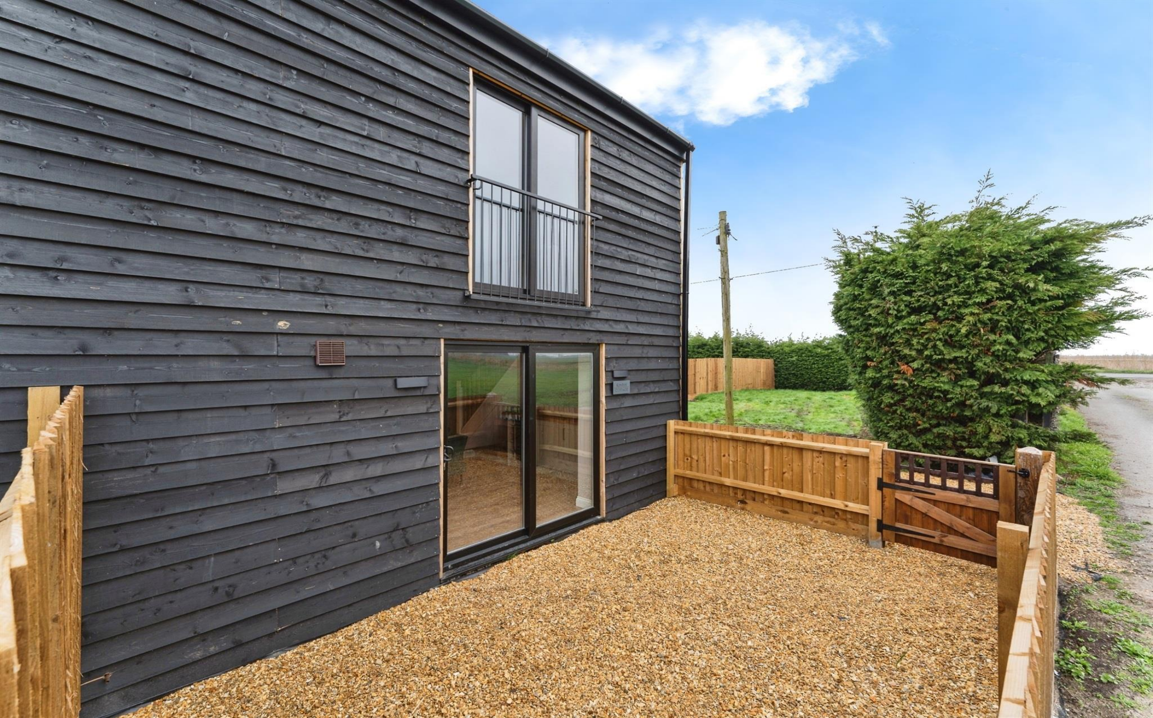
Kestrel Cottage Wimblington Road, Manea March Guide Price £145,000 Freehold