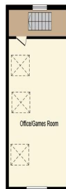
Garage First Floor

Skylight window. Window to side. Laminate floor. Wardrobes. (sloped ceilings) Bedroom Four 15' x 11' 4" ( 4.57m x 3.45m ) Two skylight windows to rear. Window to side. Radiator. Laminate floor. Bedroom Five 11' 8" x 8' 11" ( 3.56m x 2.72m ) Window to front. Radiator. Laminate floor (sloped ceiling) Bathroom Window to side. Tiled floor. Low level wc. Heated towel rail. Ceramic free standing bath with mixer taps. Vanity wash hand basin. Shaver point. Extractor fan.