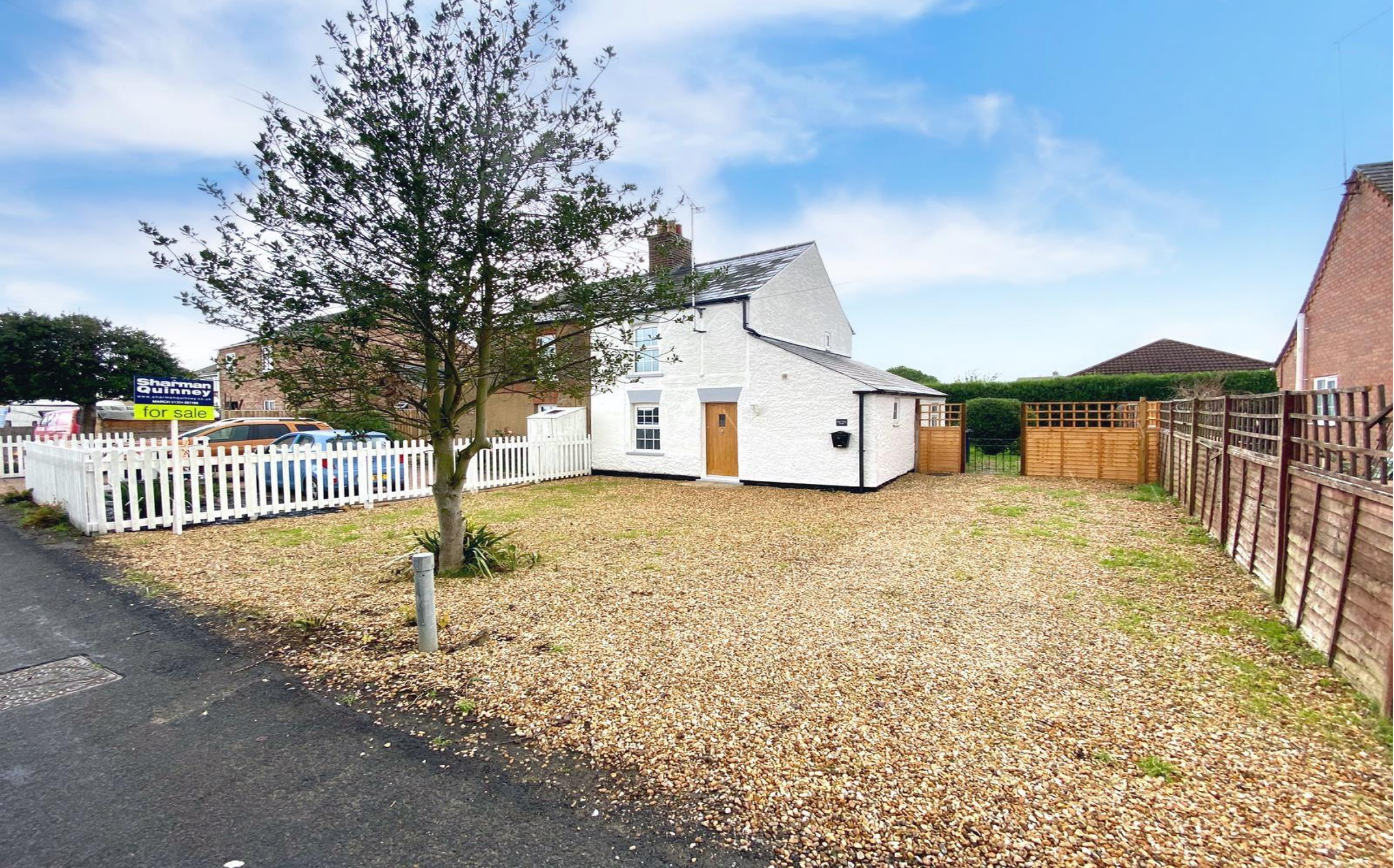
Bay Tree Cottage Crown Road, Christchurch Wisbech OIEO £175,000 Freehold