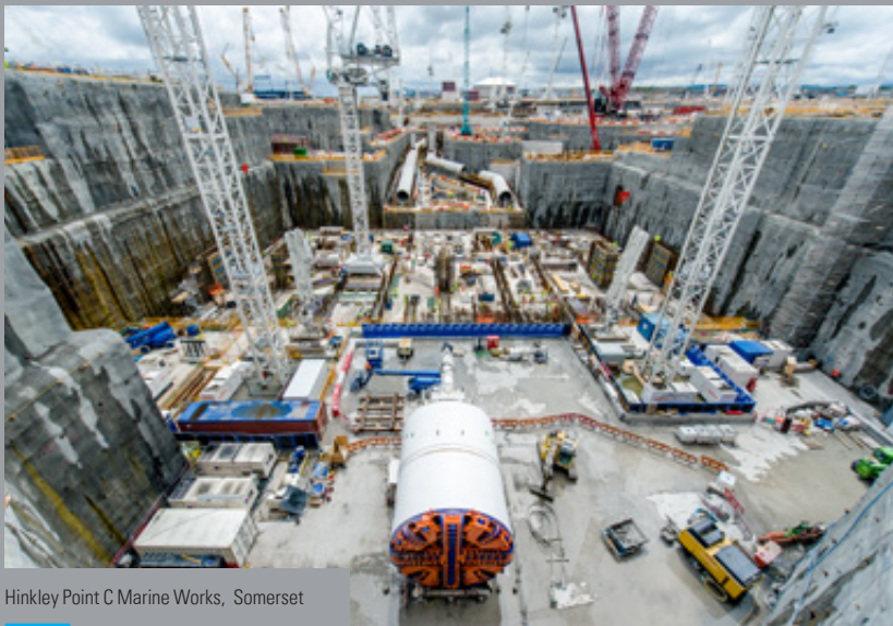
Hinkley Point C Marine Works, Somerset