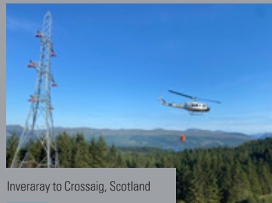
Inveraray to Crossaig, Scotland