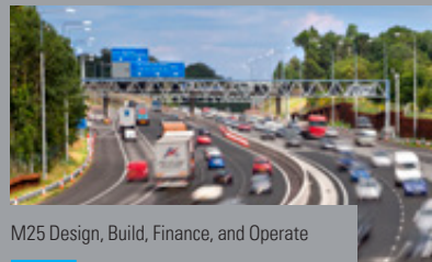
M25 Design, Build, Finance, and Operate