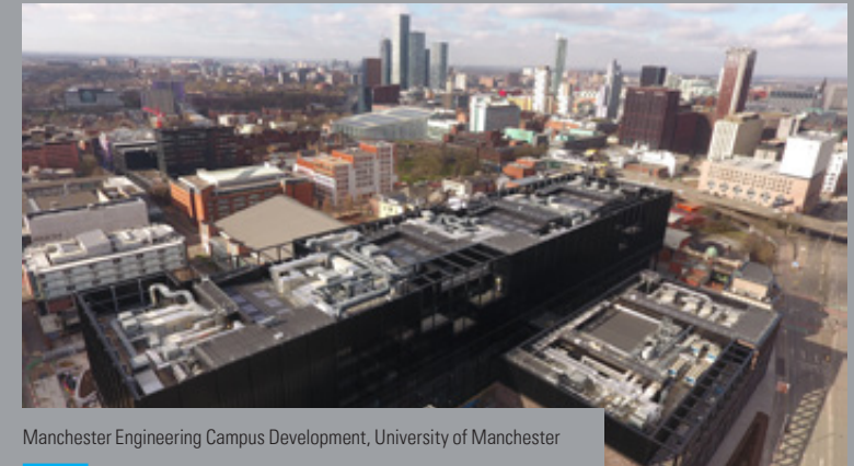
Manchester Engineering Campus Development, University of Manchester