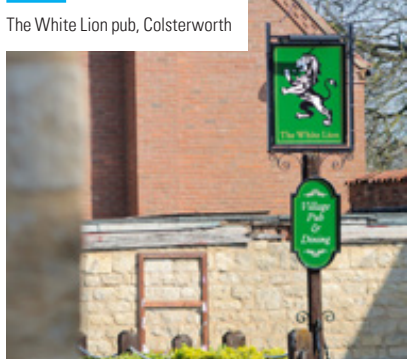
The White Lion pub, Colsterworth