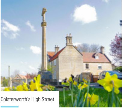
Colsterworth's High Street