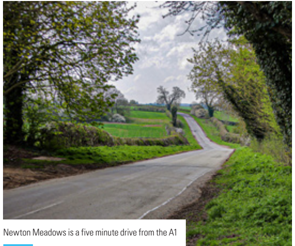
Newton Meadows is a five minute drive from the A1