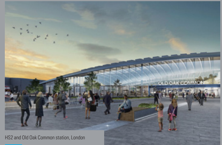
HS2 and Old Oak Common station, London