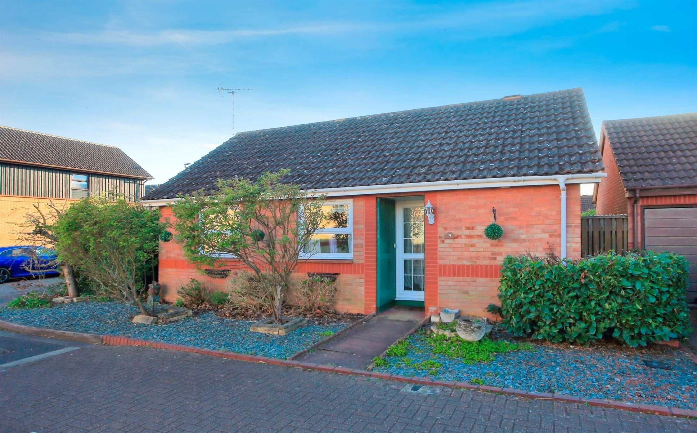
Hazel Croft, Werrington Peterborough £210,000 Freehold