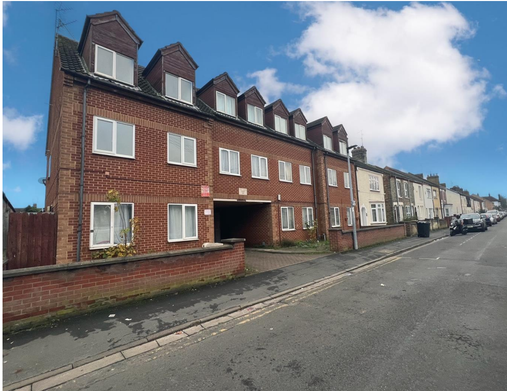
Cecil Pacey Court, Peterborough