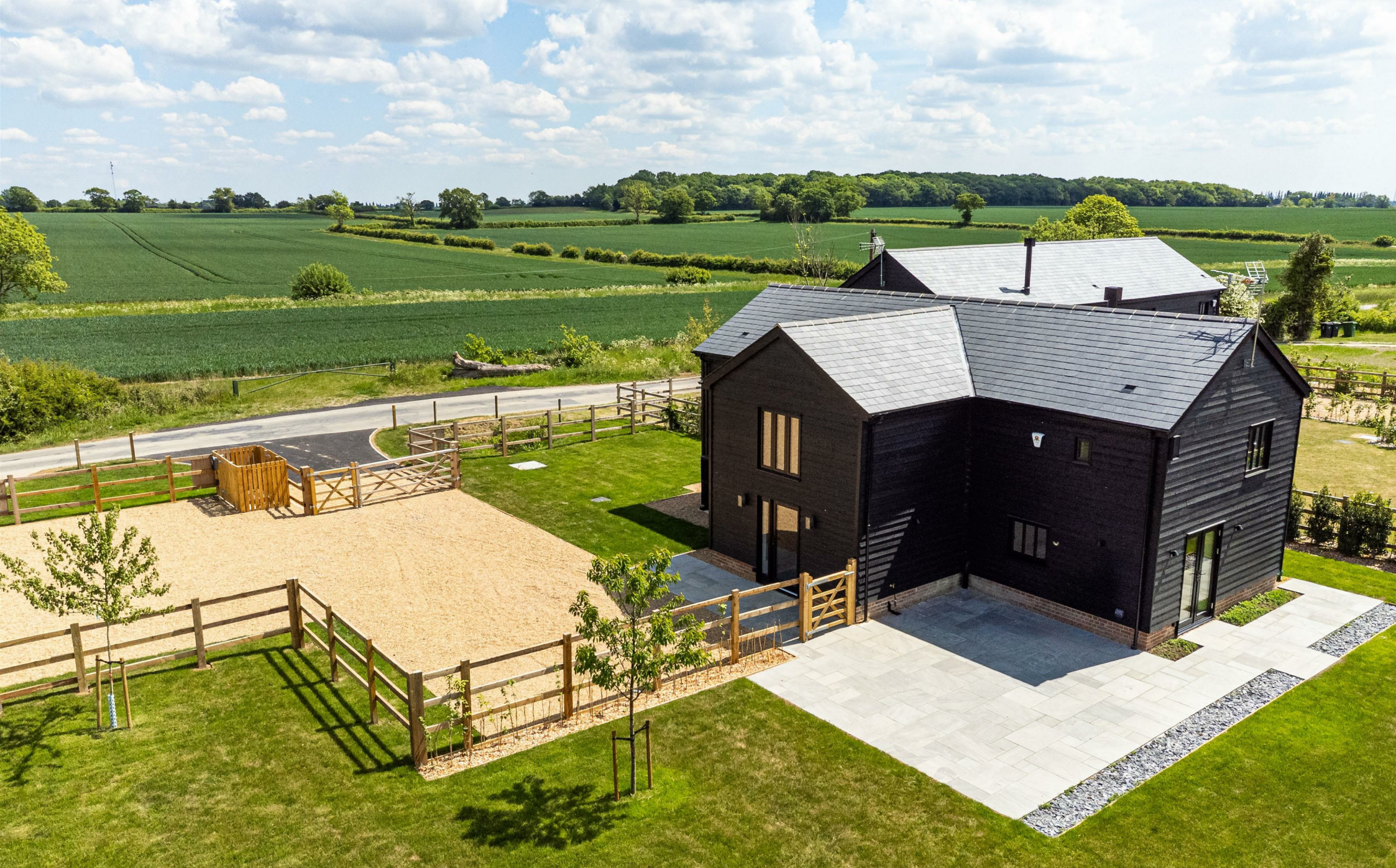
Grove Barn, Finchingfield Road, Hempstead, CB10 2PR