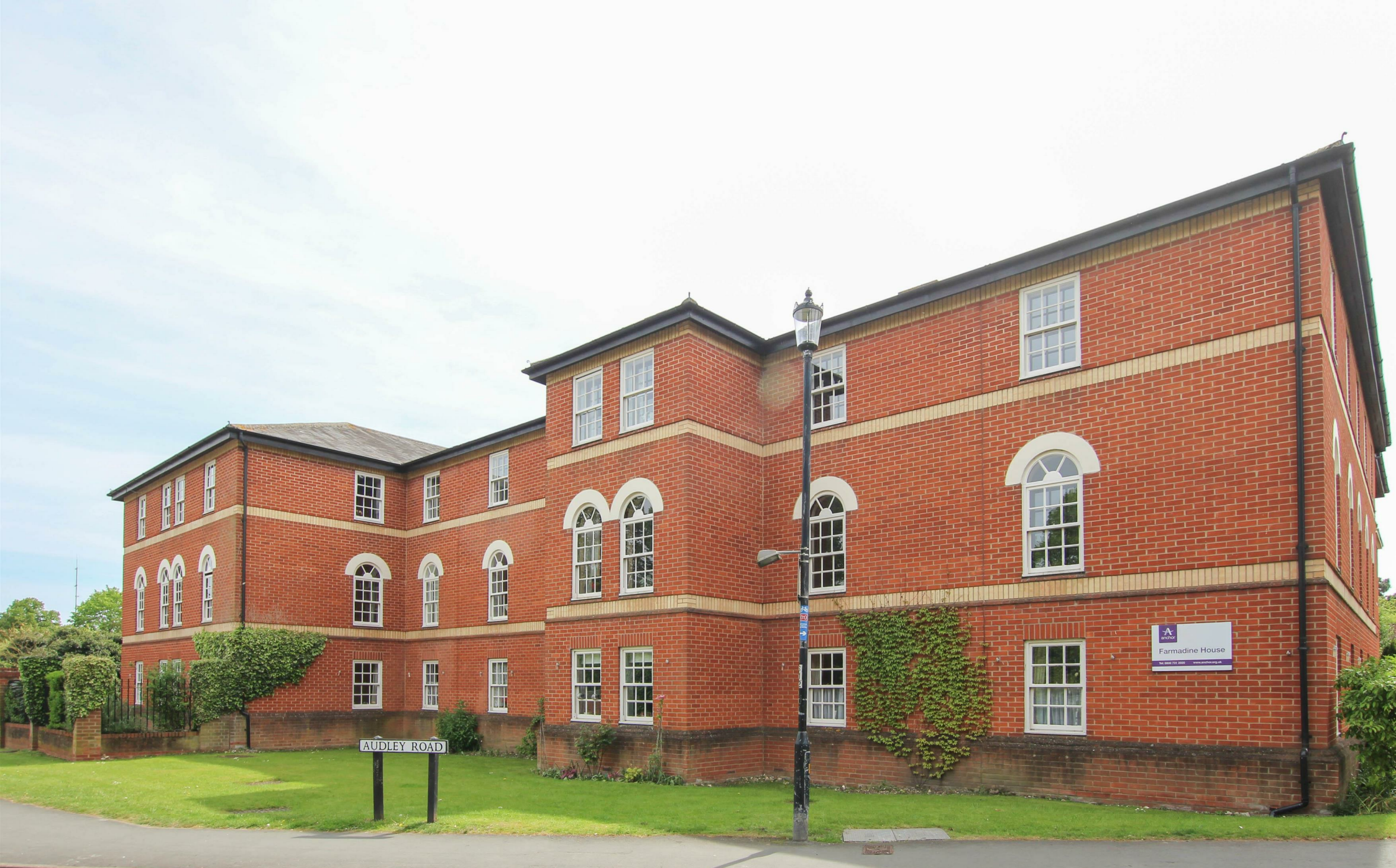
Farmadine House, Saffron Walden, CB11 3HS