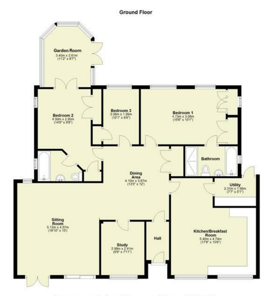
Approx. gross internal floor area 134 sqm (1450 sqft)

Guide Price £675,000 Tenure - Freehold Council Tax Band - E Local Authority - Cambridge City Council