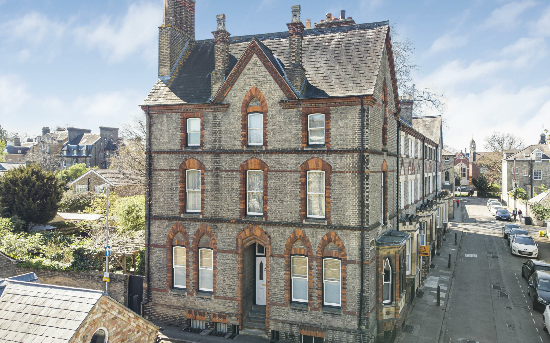
Petersham House, Pemberton Terrace, Cambridge, CB2 1JA