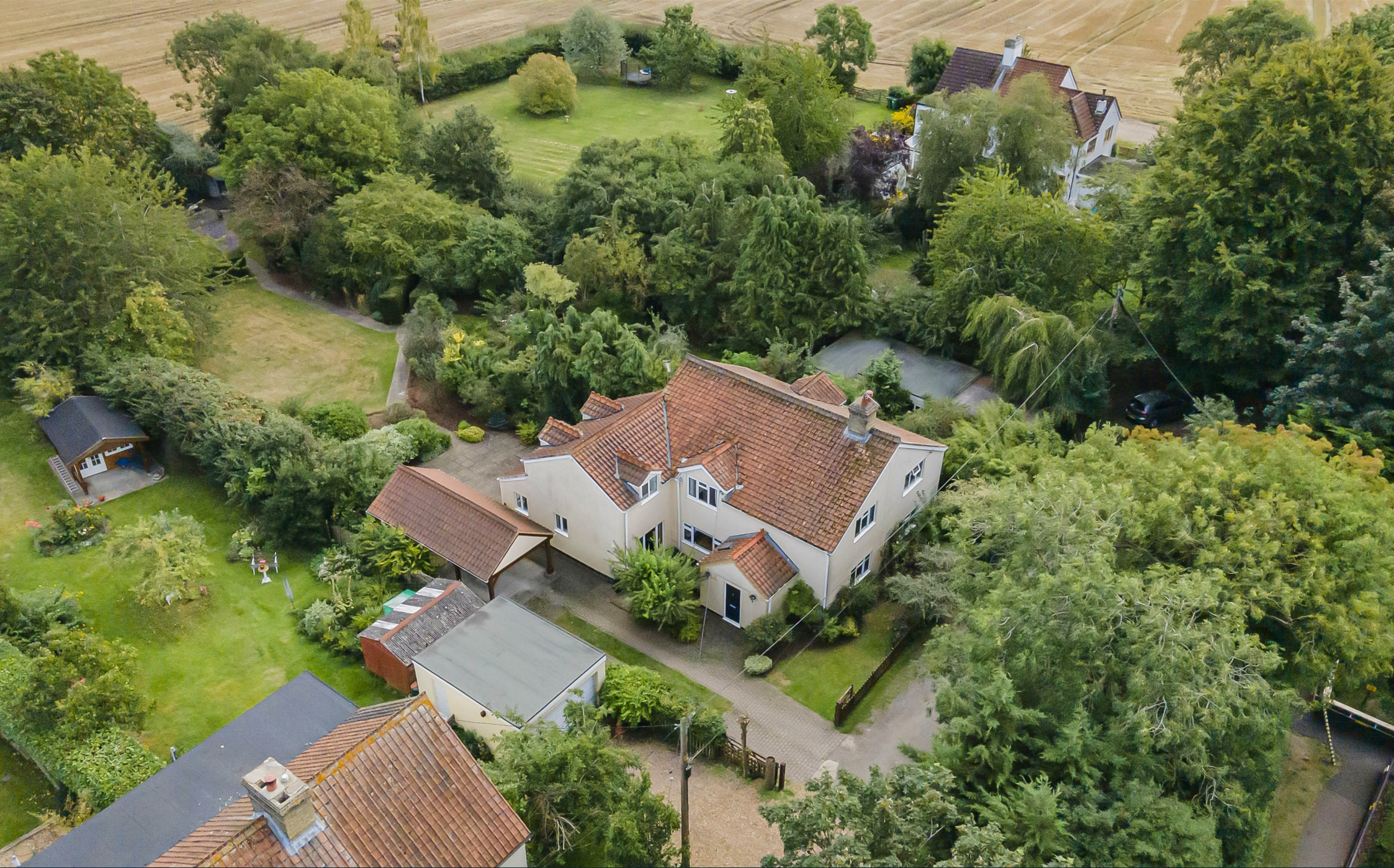
3 Edieham Cottages, Angle Lane, Shepreth, SG8 6QJ