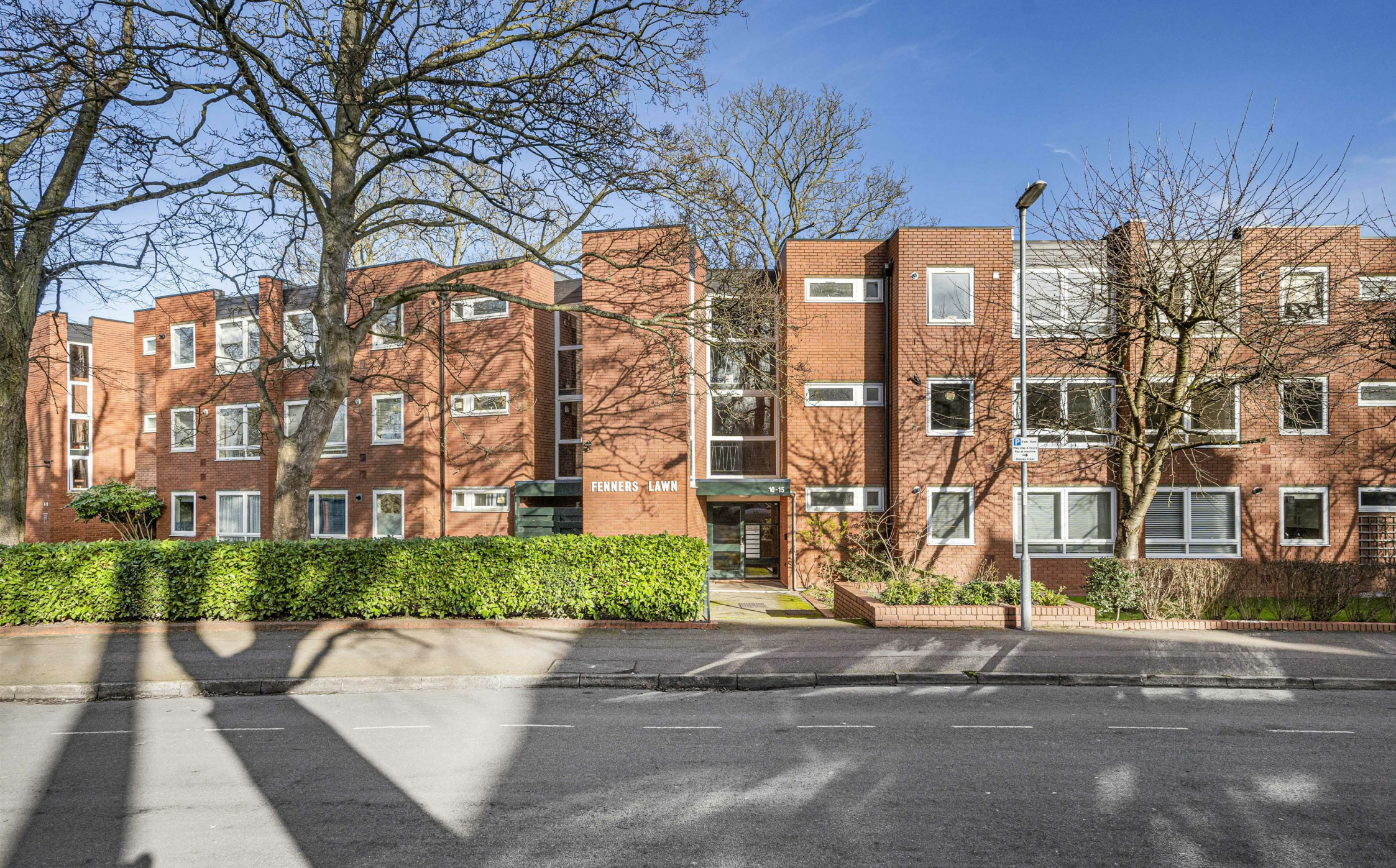
Fenners Lawn, Cambridge, CB1 2EH