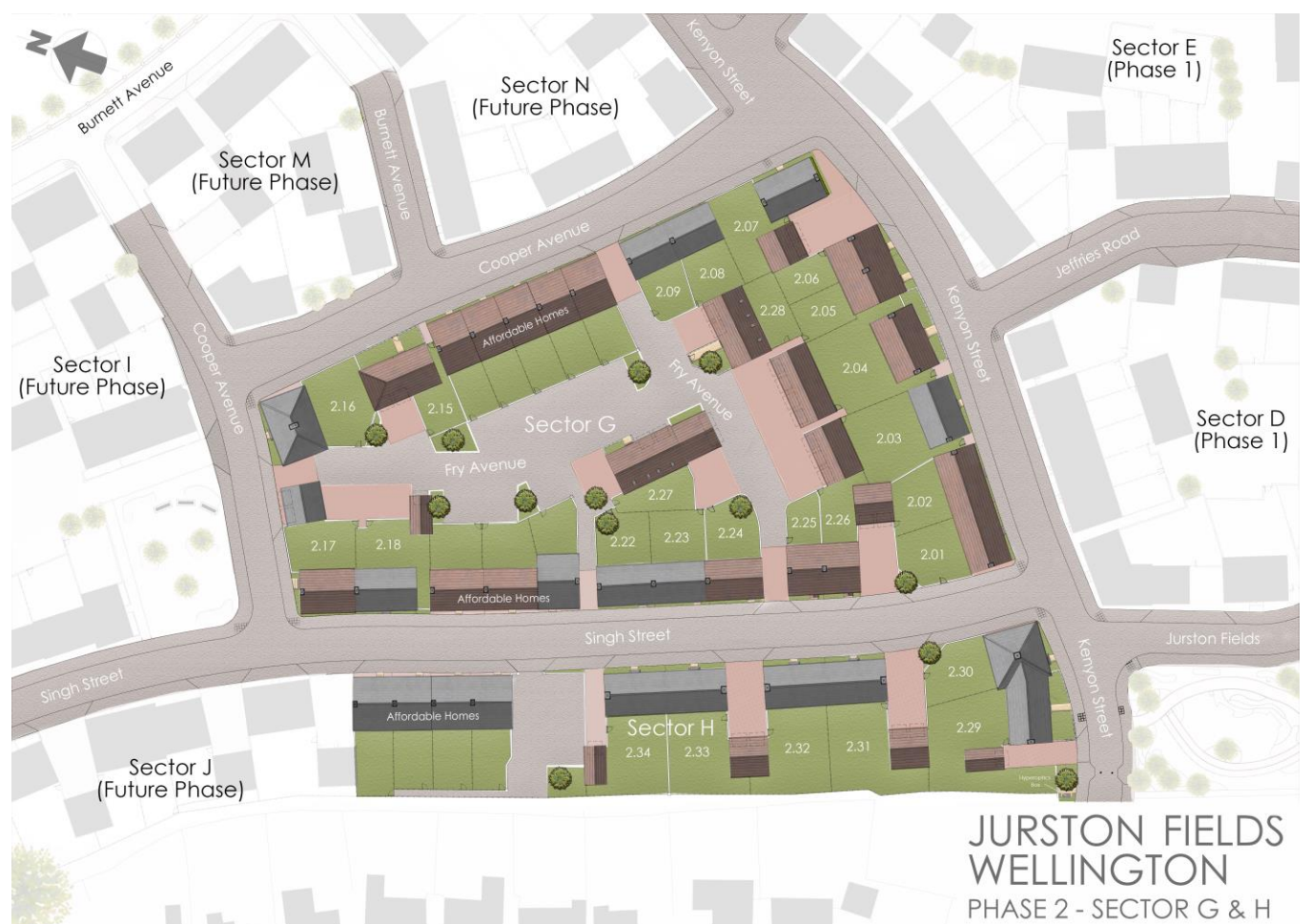
JURSTON FIELDS WELLINGTON PHASE 2 - SECTOR G & H