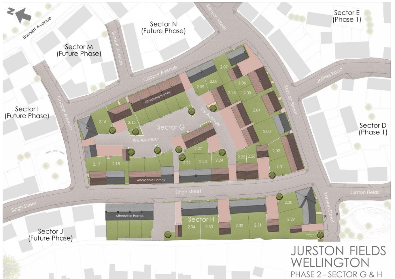
JURSTON FIELDS WELLINGTON PHASE 2 - SECTOR G & H