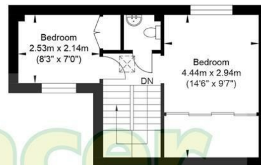
Second Floor Approximate Floor Area 291.59 sq ft (27.09 sq m)