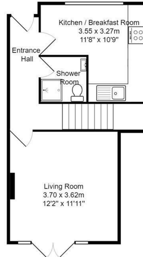
Ground Floor Area: 32.5 m 2 ... 350 ft 2