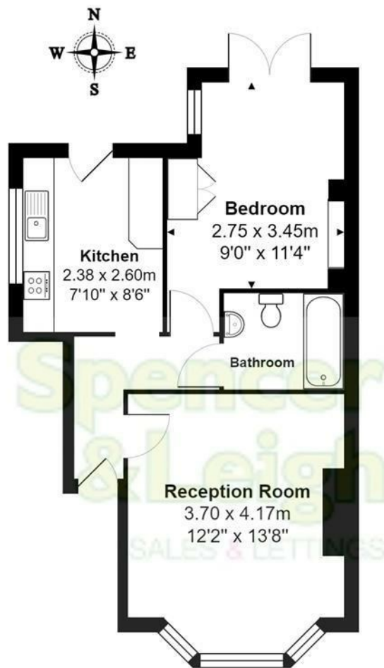
Ground Floor Flat