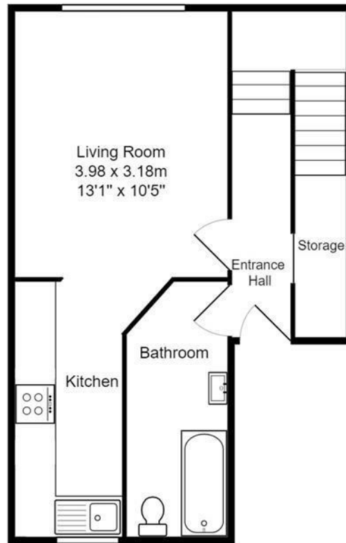
Lower Floor Area: 33.7 m 2 ... 363 ft 2