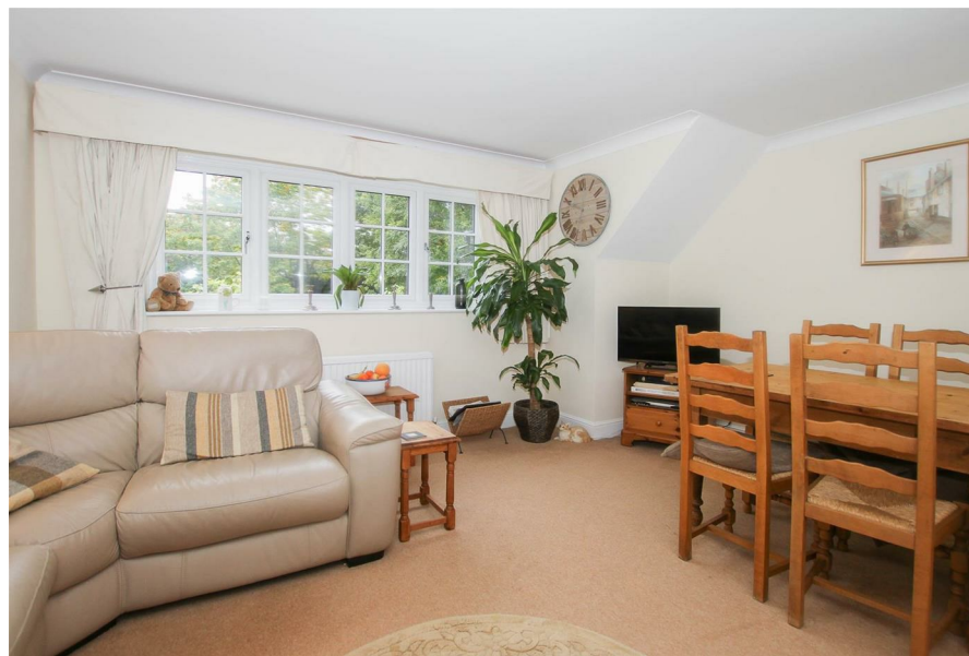
14 The Gatehouse Station Lane, Ingatestone, CM4 0BL

TOTAL APPROX. FLOOR AREA 781 SQ.FT. (72.5 SQ.M.) THIS PLAN IS FOR ROOM IDENTIFICATION ONLY, AND ITS ACCURACY IS NOT GUARANTEED. www.epcsinsex.co.uk Made with Metropix ©2020