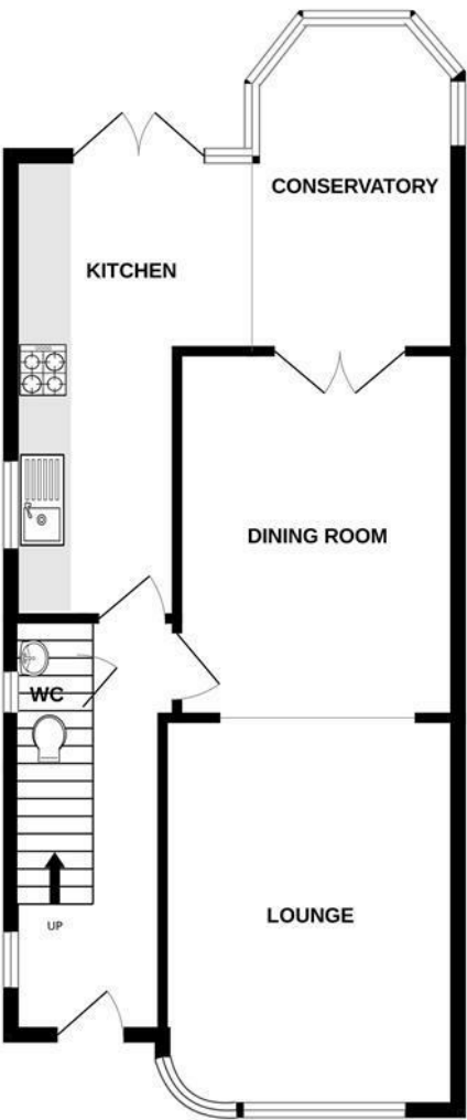
GROUND FLOOR 627 sq.ft. (58.3 sq.m.) approx.