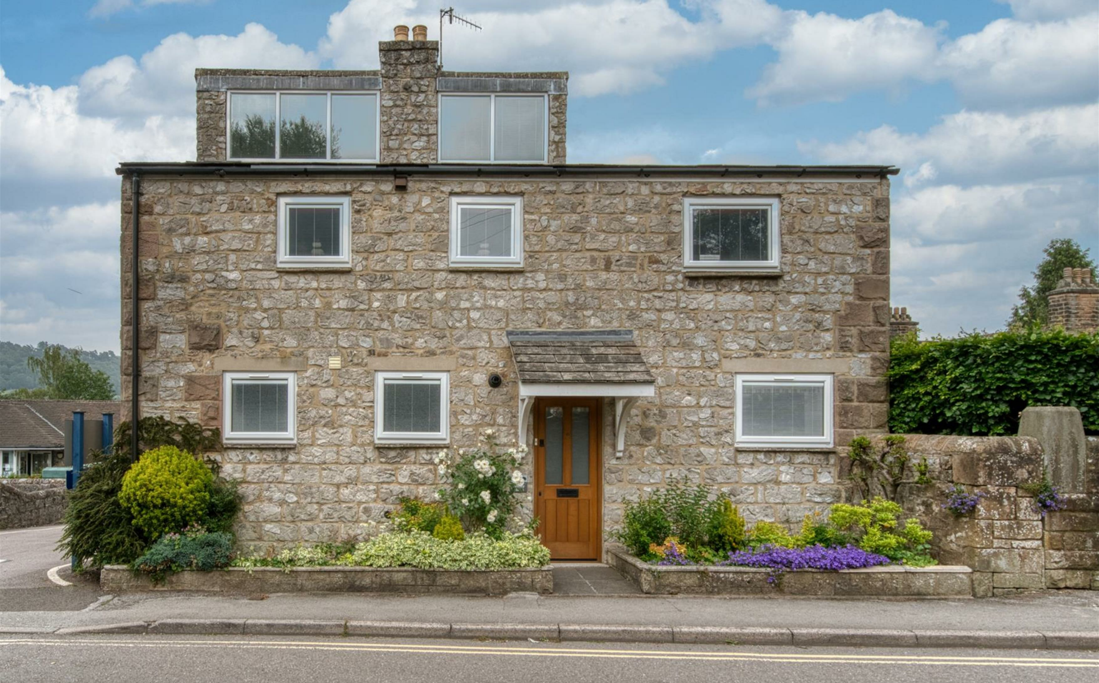
Hooley House, 14 Butts Road, Bakewell, DE45 1EB